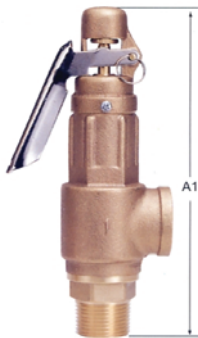
N3L Type Lever 1/2"~2"