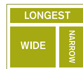
Drawers' position indication