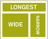
Drawers' position indication

➡ The extra side tray can also double as a paper roll support which is ideal for oily applications.