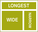
Drawers' position indication

CABINET + TROLLEY SERIES Safety features: One-at-a time drawer opening system & lock handle function are optional but highly recommended.