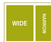
Drawers' position indication