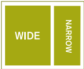
Drawers' position indication