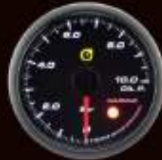
360OP-SM2 (BAR/PSI) ELECTRICAL OIL PRESSURE GAUGE W / SENSOR