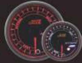
548AFR-52 548AFR-60 ELECTRICAL AIR / FUEL RATIO GAUGE