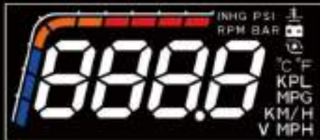
750OBDII-2 6 FUNCTION IN 1 GAUGE BOOST / WATER TEMP / VOLT / TACHOMETER SPEEDOMETER / FUEL CONSUMPTION