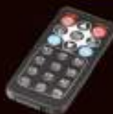
F90-RMT REMOTE CONTROLLER