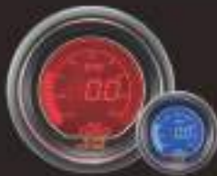
512BO(Bar/PSI) ELECTRICAL BOOST GAUGE W / SENSOR

52 mm BLUE / RED & GREEN / WHITE LCD GAUGE SERIES