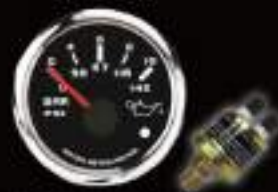
MMOPW-90B(010) ELECTRICAL OIL PRESSURE GAUGE WARNING-0.8BAR W/SENSOR 0-10 BAR/0-145 PSI