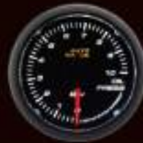
348OP-52 (Bar / PSI) ELECTRICAL OIL PRESSURE GAUGE W / SENSOR