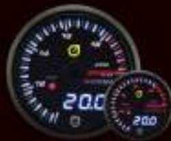
599WB ELECTRICAL WIDEBAND AIR/FUEL RATIO GAUGE W/ BOSCH LSU4.9 O2 SENSOR