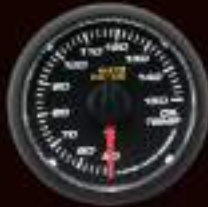
348OT-52C (°C / °F) ELECTRICAL OIL TEMP GAUGE W / SENSOR