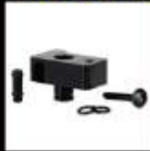
F60BO-2 FOR VAG GOLF MK7