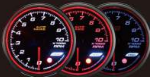
F50TA-80 ELECTRICAL TACHOMETER 0 ~ 10,000 RPM