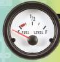
250FLW-12 (FOR 12V) FUEL LEVEL GAUGE 240Ω -33Ω