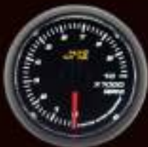
348RPM-52 ELECTRICAL TACHOMETER GAUGE 0-10,000 RPM