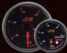
430VA-52 (Bar / inHg) 430VA-60 (Bar / inHg) ELECTRICAL VACUUM GAUGE W / SENSOR WARNING : VACUUM > 0 BAR