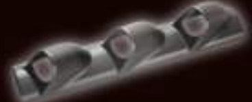
166-R03B (52 mm) 275-R03B (60 mm) 166-L03B (52 mm) 275-L03B (60 mm)