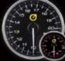
355WB-60 60MM NEEDLE LED DISPLAY WHITE / AMBER