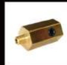
F60OP-5 FOR GT86