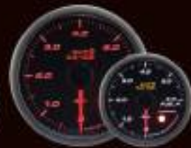
430FP-52 (Bar / PSI) 430FP-60 (Bar / PSI) ELECTRICAL FUEL PRESSURE GAUGE W / SENSOR WARNING : FUEL PRESSURE < 2BAR