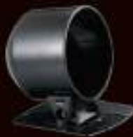
F60-MC 52mm mounting cup for 348, 512 and 512 series