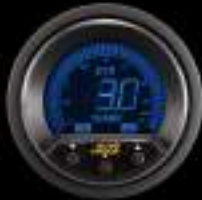
488BO (BAR/PSI) ELECTRICAL BOOST GAUGE W/ SENSOR

52mm BLUE / RED / WHITE / GREEN LCD GAUGE SERIES WITH WARNING & PEAK