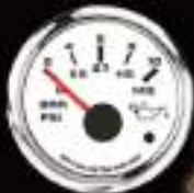
MMOPW-90W(010) ELECTRICAL OIL PRESSURE GAUGE WARNING-0.8BAR W/SENSOR 0-10BAR, 0-145PSI