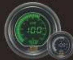
612WT(°C / °F) ELECTRICAL WATER TEMP GAUGE W / SENSOR