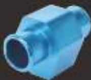
F4026 28 m/m FOR WATER TEMP GAUGE SENSOR USE