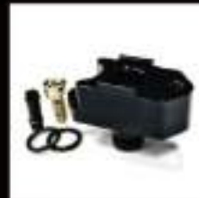
F60BO-7 FOR BMW B48