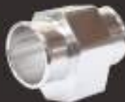
F4038 38 m/m FOR WATER TEMP GAUGE SENSOR USE