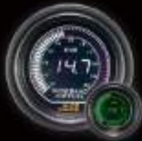
612WB 52MM DIGITAL LCD DISPLAY WHITE / GREEN