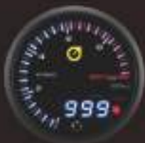
586RPM ELECTRICAL TACHOMETER GAUGE 0-10,000 RPM