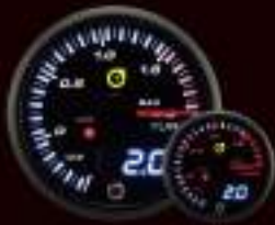
599BO (BAR/PSI) ELECTRICAL BOOST GAUGE W/ SENSOR

52mm WHITE / AMBER LED GAUGE SERIES WITH WARNING