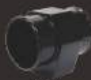
F4048 48 m/m FOR WATER TEMP GAUGE SENSOR USE