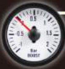
275BOW-12V 52mm MECHANICAL BOOST GAUGE -1 BAR ~ 2BAR