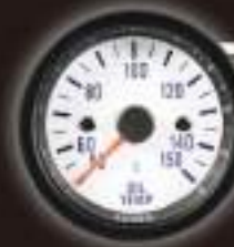
275OTW-12V 52mm ELECTRICAL OIL TEMP GAUGE (W/SENSOR) 50°C ~ 150 °C