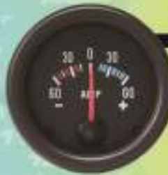
250AM-12 (FOR 12V) 52mm ELECTRICAL AMMETER GAUGE -60A - 60A