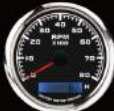
MMTA270-80HB ELECTRICAL TACHOMETER 0-6000 RPM WITH HOUR METER