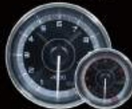
F355TA-52-WP F355TA-60-WP ELECTRICAL TACHOMETER GAUGE