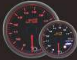
548VO-52 548VO-60 ELECTRICAL VOLT GAUGE