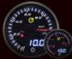
599OP (BAR/PSI) ELECTRICAL OIL PRESSURE GAUGE W/ ELEC. SENSOR