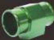
F4036 36 m/m FOR WATER TEMP GAUGE SENSOR USE