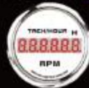
MMHMTA-DGW DIGITAL TACHOMETER WITH HOUR METER