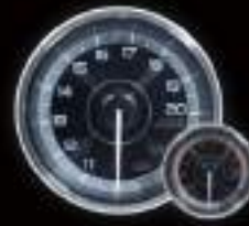
F355WB-52 52MM METALLIC-TONE DIAL PLATE NEEDLE LED DISPLAY WHITE / AMBER