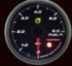
360FP-SM2 (BAR/PSI) ELECTRICAL FUEL PRESSURE GAUGE W / SENSOR