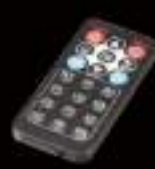
F90-RMT REMOTE CONTROLLER (RECHARGEABLE BATTERY)