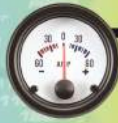
250AMW-12 (FOR 12V) AMMETER GAUGE -60A - 60A