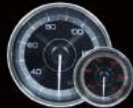
F355WT-52-WP (°C/°F) F355WT-60-WP (°C/°F) ELECTRICAL WATER TEMP GAUGE W / SENSOR