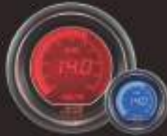
512VO ELECTRICAL VOLT GAUGE