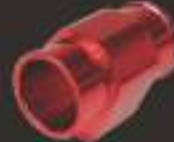
F4034 34 m/m FOR WATER TEMP GAUGE SENSOR USE