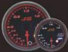
548BO-52 (Bar / PSI) 548BO-60 (Bar / PSI) ELECTRICAL BOOST GAUGE W / SENSOR

WHITE / AMBER LED DISPLAY WITH WARNING & PEAK