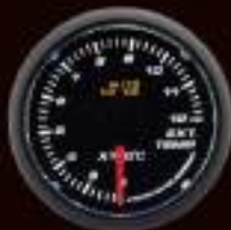
348EGT-52 (°C / °F) ELECTRICAL EXHAUST GAS TEMP GAUGE 200°C-1200°C W / SENSOR