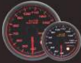
458WT-52 (°C / °F) 458WT-60 (°C / °F) ELECTRICAL WATER TEMP GAUGE W / SENSOR WARNING : WATER TEMP > 100 °C