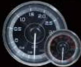
F355BO-52-WP (BAR/PSI) F355BO-60-WP (BAR/PSI) ELECTRICAL BOOST GAUGE W / SENSOR

52/60mm CLEAR LENS WHITE & AMBER LED SERIES METALLIC TONE DIAL PLATE W / WATERPROOF SENSOR CONNECTOR