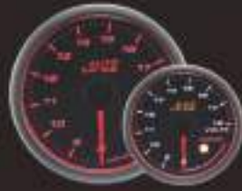
458VO-52 458VO-60 ELECTRICAL VOLT GAUGE WARNING : VOLT < 11.5V