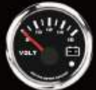
MMVOW-90B(816) ELECTRICAL VOLT GAUGE WARNING-11.5V