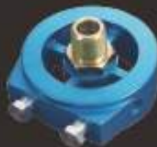
F50OPOT-2 SENSOR ATTACHMENT FOR OIL TEMP / OIL PRESSURE GAUGE SENSOR USE (M20 x P1.5)