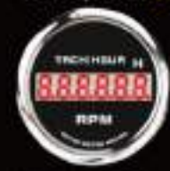
MMHMTA-DCR DIGITAL TACHOMETER WITH HOUR METER