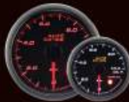
430OP-52 (Bar / PSI) 430OP-60 (Bar / PSI) ELECTRICAL OIL PRESSURE GAUGE W / SENSOR WARNING : OIL PRESSURE < 0.75BAR