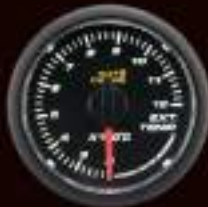
348EGT-52C (°C / °F) ELECTRICAL EXHAUST GAS TEMP GAUGE 200°C ~ 1100°C W / SENSOR