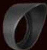
INCLUDED GAUGE CAP