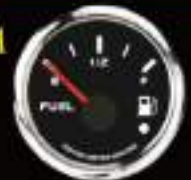
MMFLW-90B(0190) MMFLW-90B(24033) ELECTRICAL FUEL LEVEL GAUGE WARNING-1.7% 0-190 OHM 240-33 OHM