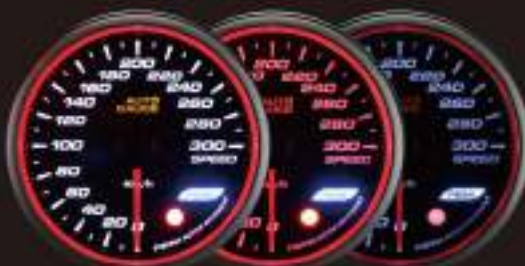
F50SP-80 ELECTRICAL SPEEDOMETER 0 ~ 300 km/h

Manufacturer & Exporer Auto Meter(Taiwan) Co.,Ltd