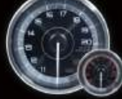
F355WB-60 60MM METALLIC-TONE DIAL PLATE NEEDLE LED DISPLAY WHITE / AMBER