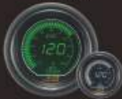
612OT(°C / °F) ELECTRICAL OIL TEMP GAUGE W / SENSOR