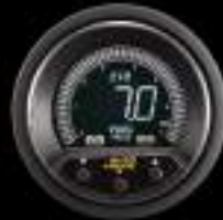
488FP (BAR/PSI) ELECTRICAL FUEL PRESSURE GAUGE W/ ELEC. SENSOR