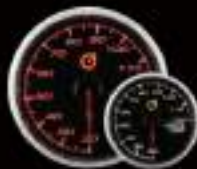
550OBD2-WT 60mm ANALOG WATER TEMP GAUGE