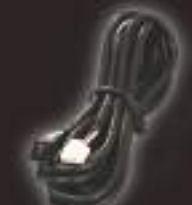
208SMBOWH SENSOR WIRE FOR STEPPER MOTOR BOOST & VACUUM GAUGE