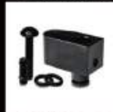
F60BO-11 FOR MINI COOPER