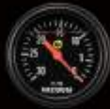
286VA WET BLANK OIL PRESSURE GAUGE 0 - 100PSI