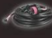
208SMOPWH-PK SENSOR WIRE FOR STEPPER MOTOR OIL PRESSURE & FUEL PRESSURE GAUGE