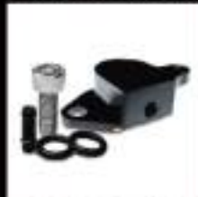
F60BO-10 FOR HYUNDAI SANTA FE