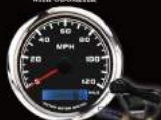
MMSP270-GPS-120B-MP ELECTRICAL GPS SPEEDOMETER 0-120 MPH WITH ODOMETER W/GPS SENSOR