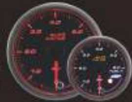
548FP-52 (Bar / PSI) 548FP-60 (Bar / PSI) ELECTRICAL FUEL PRESSURE GAUGE W / SENSOR