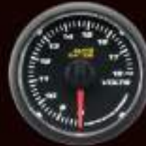
348VO-52C ELECTRICAL VOLT GAUGE