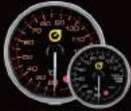
355WT-52-WP (°C/°F) 355WT-60-WP (°C/°F) ELECTRICAL WATER TEMP GAUGE W / SENSOR