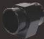
F4046 46 m/m FOR WATER TEMP GAUGE SENSOR USE