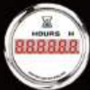
MMWKHM-DGW DIGITAL HOUR METER GAUGE