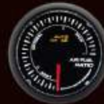
348AFR-52 ELECTRICAL AIR / FUEL RATIO GAUGE