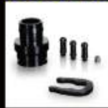
F60BO-3 FOR VW 2.0 FS/TSI