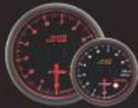
458RPM-52 458RPM-60 ELECTRICAL TACHOMETER GAUGE 0-10,000 RPM WARNING : RPM > 5,000 RPM