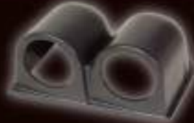
166-02B (52 mm) 275-02B (60 mm)