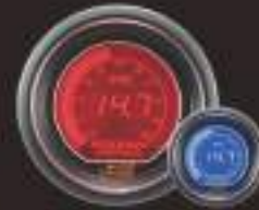
512WB ELECTRICAL WIDEBAND AIR / FUEL RATIO GAUGE W / BOSCH LSU4.3 O2 SENSOR 0 - 5V OUTPUT