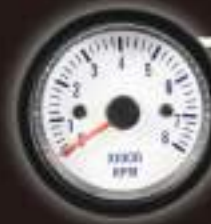
275TAW-12V 52mm ELECTRICAL TACHOMETER GAUGE 0 ~ 8,000 RPM