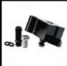
F60BO-9 FOR BENZ A45