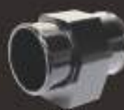
F4050 50 m/m FOR WATER TEMP GAUGE SENSOR USE