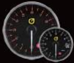
355TA-52-WP 355TA-60-WP ELECTRICAL TACHOMETER GAUGE 0 - 10,000 RPM