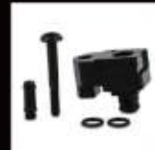
F60BO-8 FOR MINI B48