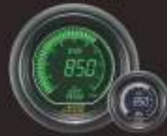
612EGT(°C / °F) ELECTRICAL EXHAUST GAS TEMP GAUGE W / SENSOR