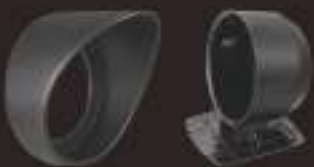
INCLUDED : MOUNTING CAP & MOUNTING STAND