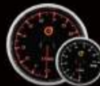
550OBD2-TA 60mm ANALOG TACHOMETER GAUGE