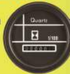
250HM 52mm ELECTRICAL HOUR METER 5V-50V