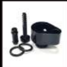
F60BO-6 FOR LEXUS IS200i