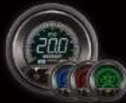
488WB 52MM DIGITAL LCD DISPLAY WHITE / BLUE / RED / GREEN