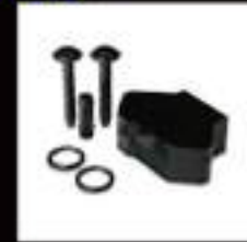
F60BO-4 FOR VW 1.2/1.4 TSI/TFSI