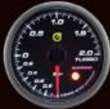
360BO-SM2 (BAR/PSI) ELECTRICAL BOOST GAUGE W / SENSOR