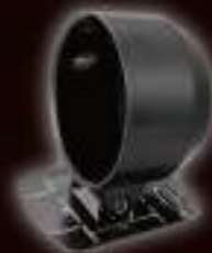
F60-52SMC (52 mm) F60-60SMC (60 mm)