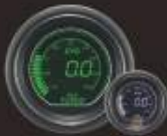
612BO(Bar/PSI) ELECTRICAL BOOST GAUGE W / SENSOR