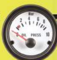
2500PW-12 (FOR 12V) 52mm ELECTRICAL OIL PRESSURE GAUGE (W/SENSOR) 0BAR-10BAR