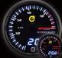
586WB 60MM NEEDLE / DIGITAL / 25 LED DISPLAY IN REAL TIME WHITE / AMBER