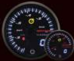
599VA (BAR/IN.HG) ELECTRICAL VACUUM GAUGE W/ SENSOR