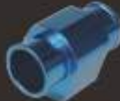
F4030 30 m/m FOR WATER TEMP GAUGE SENSOR USE