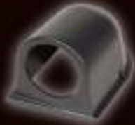
166-01B (52 mm) 275-01B (60 mm)