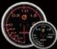
550OBD2-BO 60mm ANALOG BOOST GAUGE

60mm CLEAR LENS WHITE AND AMBER LED OBDII WITH REMOTE CONTROLLER