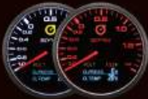
333BO4B (BAR. °C / PSI. °C) ANALOG : ELECTRICAL BOOST DIGITAL : VOLT / OIL PRESSURE / OIL TEMP W / SENSOR