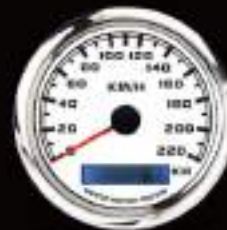
MMSP270-220W MMSP270-300W ELECTRICAL SPEEDOMETER 0-220 KM/H 0-300 KM/H WITH ODOMETER