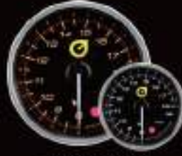
355VO-52-WP 355VO-60-WP ELECTRICAL VOLT GAUGE