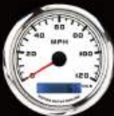
MMSP270-120W-MP ELECTRICAL SPEEDOMETER 0-120 MPH WITH ODOMETER