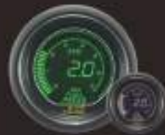
612FP(Bar/PSI) ELECTRICAL FUEL PRESSURE GAUGE W / SENSOR