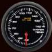
348WT-52 (°C / °F) ELECTRICAL WATER TEMP GAUGE W / SENSOR