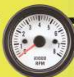
250TAW-12 (FOR 12V) TACHOMETER 0-8.000RPM