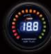
RTAFRLCD-WB4.9-WO 52MM 7-SEGMENT LED DISPLAY BLUE