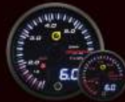
599FP (BAR/PSI) ELECTRICAL FUEL PRESSURE GAUGE W/ ELEC. SENSOR