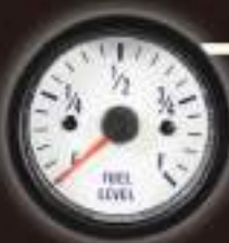
275FLW-12V 52mm ELECTRICAL FUEL LEVEL GAUGE 240Ω ~ 33Ω