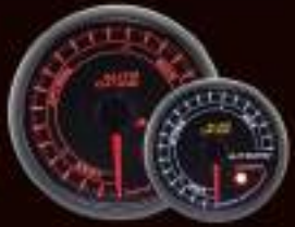
430AFR-52 430AFR-60 ELECTRICAL AIR / FUEL RATIO GAUGE WARNING : A / F < LEAN