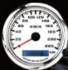
MMSP270-GPS-220W MMSP270-GPS-300W ELECTRICAL GPS SPEEDOMETER 0-220 KM/H 0-300 KM/H WITH ODOMETER W/GPS SENSOR