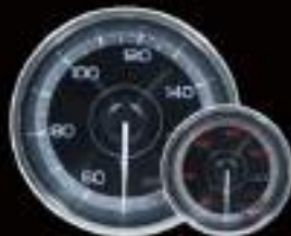
F355OT-52-WP (°C/°F) F355OT-60-WP (°C/°F) ELECTRICAL OIL TEMP GAUGE W / SENSOR