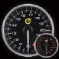
355WB-52 52MM NEEDLE LED DISPLAY WHITE / AMBER