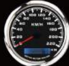
MMSP270-220B MMSP270-300B ELECTRICAL SPEEDOMETER 0-220 KM/H 0-180 KM/H WITH ODOMETER