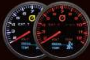
333EGT4B (BAR. °C / PSI. °C) ANALOG : ELECTRICAL EXHAUST GAS TEMP DIGITAL : VOLT / PRESSURE / TEMP W / SENSOR