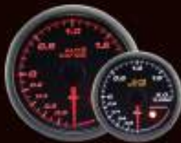
430BO-52 (Bar / PSI) 430BO-60 (Bar / PSI) ELECTRICAL BOOST GAUGE W / SENSOR WARNING : BOOST > 1.5BAR