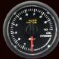
348OP-52C (Bar / PSI) ELECTRICAL OIL PRESSURE GAUGE W / SENSOR