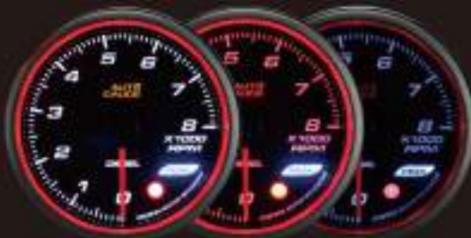
F50TADZ-80 ELECTRICAL TACHOMETER 0 ~ 8,000 RPM