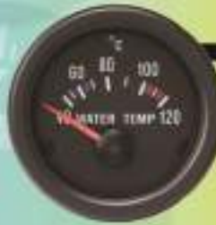
250WT-12 (FOR 12V) 52mm ELECTRICAL WATER TEMP GAUGE (W/SENSOR) 40°C-120°C