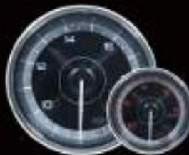
F355VO-52-WP F355VO-60-WP ELECTRICAL VOLT GAUGE