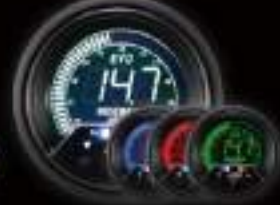
456WB 60MM DIGITAL LCD DISPLAY WHITE / BLUE / RED / GREEN