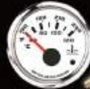
MMWTW-90W(40120) ELECTRICAL WATER TEMP GAUGE WARNING-115°C W/SENSOR 40-120°C/100-250°F