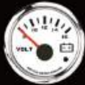
MMVOW-90W(816) ELECTRICAL VOLT GAUGE WARNING-11.5V