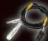
333EGTWH SENSOR WIRE FOR EXHAUST GAS TEMP GAUGE