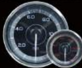
F355OP-52-WP (BAR/PSI) F355OP-60-WP (BAR/PSI) ELECTRICAL OIL PRESSURE GAUGE W / SENSOR