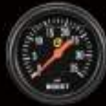
286BO-35PSI MECHANICAL BOOST GAUGE 0 - 35PSI (TYPE: 286BO-35PSI)