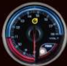
812VO-RC ELECTRICAL VOLT GAUGE