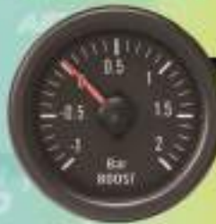
250B0-12 (FOR 12V) 52mm MECHANICAL BOOST GAUGE -1BAR-2BAR