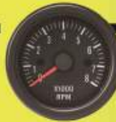
250TA-12 (FOR 12V) 52mm ELECTRICAL TACHOMETER 0-8.000RPM