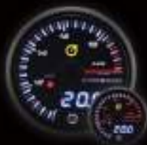
599WB 52MM NEEDLE / DIGITAL / 25 LED DISPLAY IN REAL TIME WHITE / AMBER