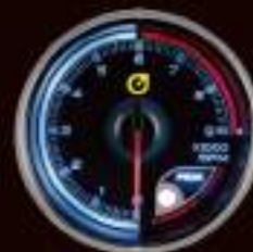
812TA-RC ELECTRICAL TACHOMETER GAUGE 0 - 5,199 RPM