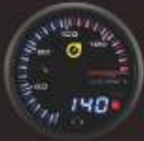
586WT (°C/°F) ELECTRICAL WATER TEMP GAUGE W / SENSOR