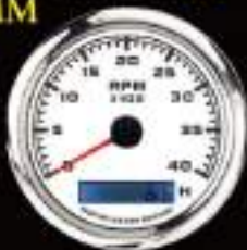
MMTA270-40HW ELECTRICAL TACHOMETER 0-4000 RPM WITH HOUR METER