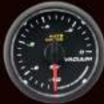
348VA-52C (Bar / inHg) ELECTRICAL VACUUM GAUGE W / SENSOR