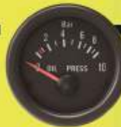
2500P-12 (FOR 12V) 52mm ELECTRICAL OIL PRESSURE GAUGE (W/SENSOR) 0BAR-10BAR