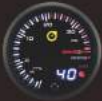
586BO (BAR/PSI) ELECTRICAL BOOST GAUGE W / SENSOR

60mm WHITE / AMBER LED GAUGE SERIES WITH WARNING