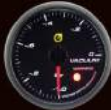
360VA-SM2 (BAR/IN. HG) ELECTRICAL VACUUM GAUGE W / SENSOR