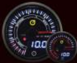
599AFR ELECTRICAL AIR/FUEL RATIO GAUGE (NARROW BAND)