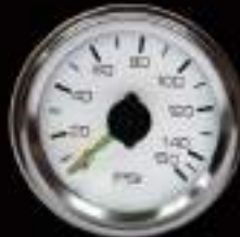
375MAPW-150(Psi) 375MAPW-10(BAR) MECHANICAL DUAL AIR SUSPENSION GAUGE WHITE FACE & CHROME RIM PSI : 0-150PSI BAR : 0-10BAR