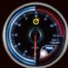
812EGT-RC (°C/°F) ELECTRICAL EXHAUST GAS GAUGE W / SENSOR