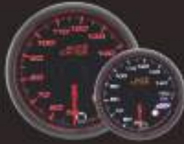
548OT-52 (°C / °F) 548OT-60 (°C / °F) ELECTRICAL OIL TEMP GAUGE W / SENSOR