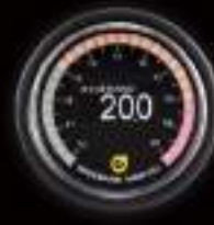
308WB-52C 52MM LED DISPLAY WITH OUTER 30 LED