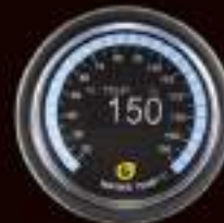
308WT-52C (°C/°F) ELECTRICAL WATER TEMP GAUGE W / SENSOR