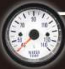
275WTW-12V 52mm ELECTRICAL WATER TEMP GAUGE (W/SENSOR) 40°C ~ 120 °C