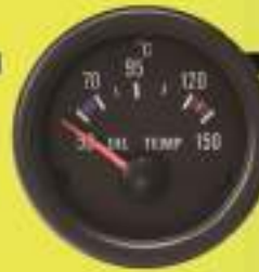
2500T-12 (FOR 12V) 52mm ELECTRICAL OIL TEMP GAUGE (W/SENSOR) 50°C-150°C