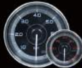
F355FP-52-WP (BAR/PSI) F355FP-60-WP (BAR/PSI) ELECTRICAL FUEL PRESSURE GAUGE W / SENSOR