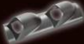
166-R02B (52 mm) 275-R02B (60 mm) 166-L02B (52 mm) 275-L02B (60 mm)