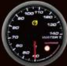
360WT-SM2 (°C/°F) ELECTRICAL WATER TEMP GAUGE W / SENSOR