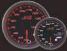
548WT-52 (°C / °F) 548WT-60 (°C / °F) ELECTRICAL WATER TEMP GAUGE W / SENSOR