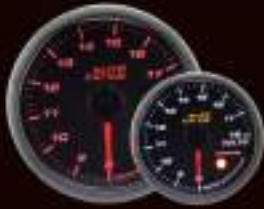
430VO-52 430VO-60 ELECTRICAL VOLT GAUGE WARNING : VOLT < 11.5V