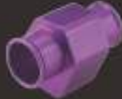
F4028 28 m/m FOR WATER TEMP GAUGE SENSOR USE