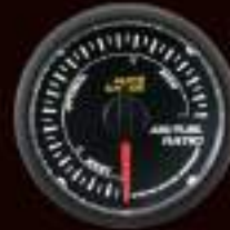
348AFR-52C ELECTRICAL AIR / FUEL RATIO GAUGE