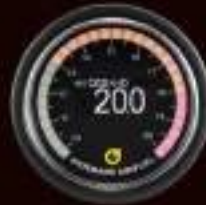
308WB-52C ELECTRICAL WIDEBAND AIR / FUEL RATIO GAUGE W / BOSCH LSU4.5 O2 SENSOR 0 - 5V OUTPUT