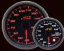
430WT-52 (°C / °F) 430WT-60 (°C / °F) ELECTRICAL WATER TEMP GAUGE W / SENSOR WARNING : WATER TEMP > 100 °C