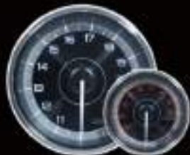
F355WB-52 F355WB-60 ELECTRICAL WIDEBAND AIR/FUEL RATIO GAUGE W/ BOSCH LSU 4.9 O2 SENSOR 0-3V OUTPUT