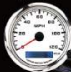
MMSP270-GPS-120W-MP ELECTRICAL GPS SPEEDOMETER 0-120 MPH WITH ODOMETER W/GPS SENSOR