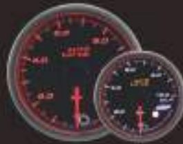
548OP-52 (Bar / PSI) 548OP-60 (Bar / PSI) ELECTRICAL OIL PRESSURE GAUGE W / SENSOR