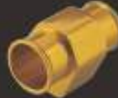
F4032 32 m/m FOR WATER TEMP GAUGE SENSOR USE