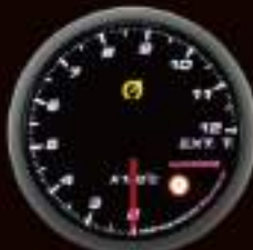
360EGT-SM2 (°C/°F) ELECTRICAL EXHAUST GAS TEMP GAUGE W / SENSOR