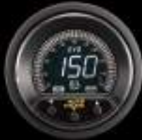
488OT (°C/°F) ELECTRICAL OIL TEMP GAUGE W/ SENSOR