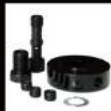
F60OP-4 FOR VW R SERIES