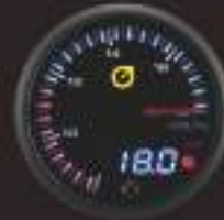
586VO ELECTRICAL VOLT GAUGE