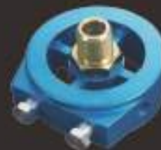
F50OPOT-3 SENSOR ATTACHMENT FOR OIL TEMP / OIL PRESSURE GAUGE SENSOR USE (3/4UNF-16)