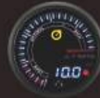
586AFR ELECTRICAL AIR / FUEL RATIO GAUGE