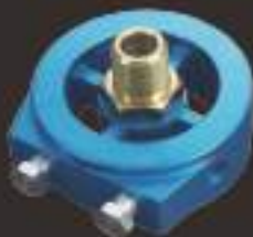
F50OPOT-1 SENSOR ATTACHMENT FOR OIL TEMP / OIL PRESSURE GAUGE SENSOR USE (M18 x P1.5)