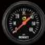
286BO-60PSI MECHANICAL BOOST GAUGE 0 - 60PSI (TYPE: 286BO-60PSI)