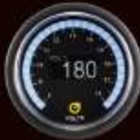
308VO-52C ELECTRICAL VOLT GAUGE