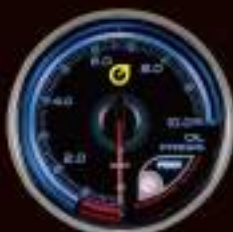
812OP-RC (BAR/PSI) ELECTRICAL OIL PRESSURE GAUGE W / SENSOR