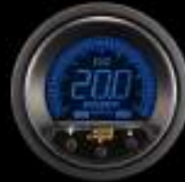
488WB ELECTRICAL WIDERBAND AIR/FUEL RATIO GAUGE W/ BOSCH LSU4.3 O2 SENSOR