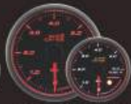
458FP-52 (Bar / PSI) 458FP-60 (Bar / PSI) ELECTRICAL FUEL PRESSURE GAUGE W / SENSOR WARNING : FUEL PRESSURE < 2 BAR