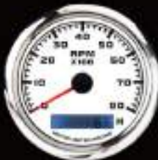
MMTA270-80HW ELECTRICAL TACHOMETER 0-8000 RPM WITH HOUR METER