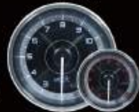
F355EGT-52-WP (°C/°F) F355EGT-60-WP (°C/°F) ELECTRICAL EXHAUST GAS TEMP GAUGE W / SENSOR