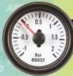
250BOW-12 (FOR 12V) 52mm MECHANICAL BOOST GAUGE -1BAR-26BAR