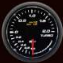
348BO-52 (Bar / PSI) ELECTRICAL BOOST GAUGE W / SENSOR