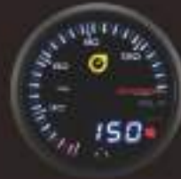
586OP (BAR/PSI) ELECTRICAL OIL PRESSURE GAUGE W / SENSOR