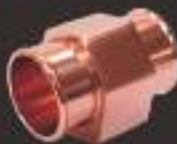
F4040 40 m/m FOR WATER TEMP GAUGE SENSOR USE