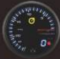
586VA (BAR/INHG) ELECTRICAL VACUUM GAUGE W / SENSOR