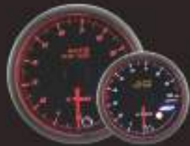
548RPM-52 548RPM-60 ELECTRICAL TACHOMETER GAUGE 0-10,000 RPM