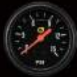
286MP-15PSI WET BLANK OIL PRESSURE GAUGE 0 - 15PSI