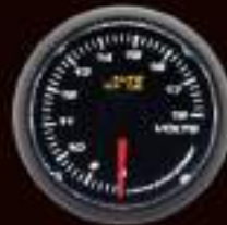
348VO-52 ELECTRICAL VOLT GAUGE