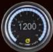
308EGT-52C (°C/°F) ELECTRICAL EXHAUST GAS TEMP GAUGE W / SENSOR