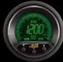
488EGT (°C/°F) ELECTRICAL EXHAUST GAS TEMP GAUGE W/ SENSOR