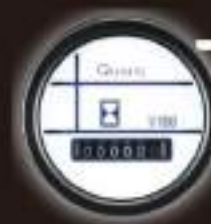
275HMW 52mm ELECTRICAL HOUR METER GAUGE 5V ~ 50V