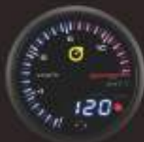
586EGT (°C/°F) ELECTRICAL EXHAUST GAS TEMP GAUGE W / SENSOR