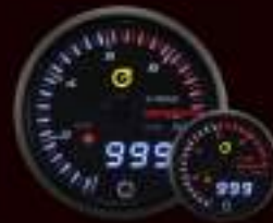
599TA ELECTRICAL TACHOMETER 0-10,000 RPM