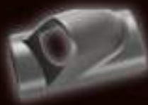
166-R01B (52 mm) 275-R01B (60 mm) 166-L01B (52 mm) 275-L01B (60 mm)