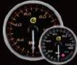
355OP-52-WP (BAR/PSI) 355OP-60-WP (BAR/PSI) ELECTRICAL OIL PRESSURE GAUGE W / SENSOR