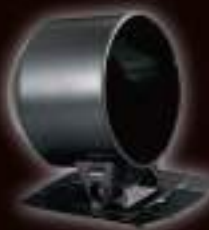
F60-MC (52 mm)