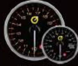
355AFR-52-WP 355AFR-60-WP ELECTRICAL AIR/ FUEL RATIO GAUGE NARROW BAND