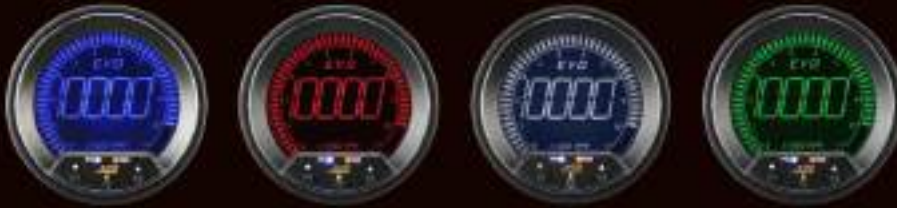
857TA ELECTRICAL TACHOMETER

85mm BLUE / RED / WHITE / GREEN LCD GAUGE SERIES WITH WARNING & PEAK