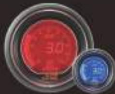
512OP(Bar/PSI) ELECTRICAL OIL PRESSURE GAUGE W / SENSOR