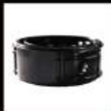
F60OP-1 FOR VAG 1.4TSI