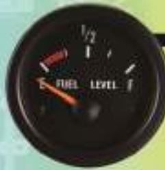
250FL-12 (FOR 12V) 52mm ELECTRICAL FUEL LEVEL GAUGE 240Ω -33Ω