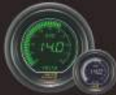
612VO ELECTRICAL VOLT GAUGE