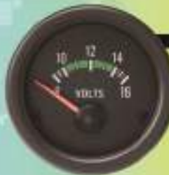
250V0-12 (FOR 12V) 52mm ELECTRICAL VOLT GAUGE 8V-16V