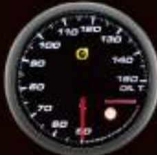
360OT-SM2 (°C/°F) ELECTRICAL OIL TEMP GAUGE W / SENSOR