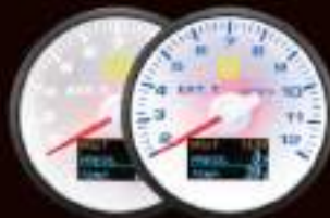
333EGT4W (BAR. °C / PSI. °C) ANALOG : ELECTRICAL EXHAUST GAS TEMP DIGITAL : VOLT / PRESSURE / TEMP W / SENSOR