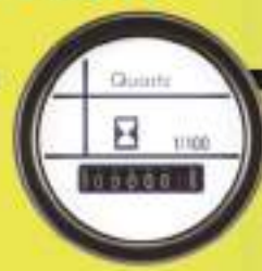
250HMW 52mm ELECTRICAL HOUR METER 5V-50V