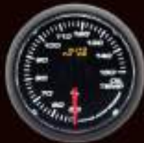
348OT-52 (°C / °F) ELECTRICAL OIL TEMP GAUGE W / SENSOR