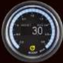
308BO-52C (BAR/PSI) ELECTRICAL BOOST GAUGE W / SENSOR

52mm CLEAR LENS DIGITAL OLED DISPLAY WITH OUTER 30 LED