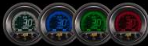
4 COLORS DISPLAY IN ONE GAUGE