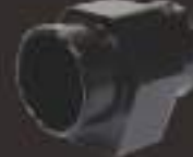
F4044 44 m/m FOR WATER TEMP GAUGE SENSOR USE