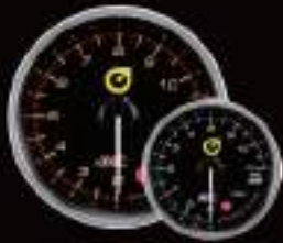
355EGT-52-WP (°C/°F) 355EGT-60-WP (°C/°F) ELECTRICAL EXHAUST GAS TEMP GAUGE W / SENSOR