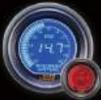
512WB 52MM DIGITAL LCD DISPLAY BLUE / RED