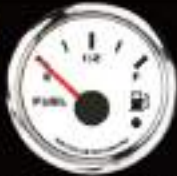
MMFLW-90W(0190) MMFLW-90W(24033) ELECTRICAL FUEL LEVEL GAUGE WARNING-1.7% 0-190 OHM 240-33 OHM