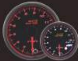
548EGT-52 (°C / °F) 548EGT-60 (°C / °F) ELECTRICAL EXHAUST GAS TEMP GAUGE W / SENSOR