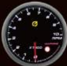
360TA-SM2 ELECTRICAL TACHOMETER GAUGE 0-10,000 RPM