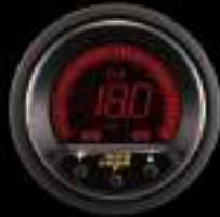
488VO ELECTRICAL VOLT GAUGE