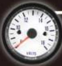
275VOW-12V 52mm ELECTRICAL VOLT GAUGE 8V ~ 16V