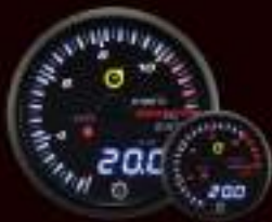
599EGT (°C/°F) ELECTRICAL EXHAUST GAS TEMP GAUGE W/ SENSOR