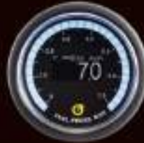
308FP-52C (BAR/PSI) ELECTRICAL FUEL PRESSURE GAUGE W / SENSOR