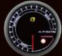
360AFR-SM2 ELECTRICAL AIR / FUEL RATIO GAUGE