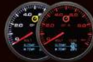
333OP4B (BAR. °C / PSI. °C) ANALOG : ELECTRICAL OIL PRESSURE DIGITAL : VOLT / OIL TEMP / WATER TEMP W / SENSOR