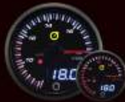
599VO ELECTRICAL VOLT GAUGE