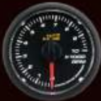
348RPM-52C ELECTRICAL TACHOMETER GAUGE 0-10,000 RPM