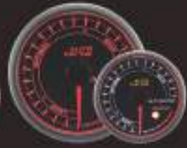
458AFR-52 458AFR-60 ELECTRICAL AIR / FUEL RATIO GAUGE WARNING : A / F < LEAN