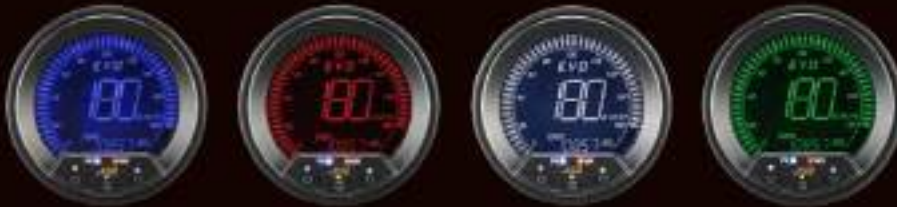
857SP (KMH/MPH) ELECTRICAL SPEEDOMETER WITH GPS FUNCTION