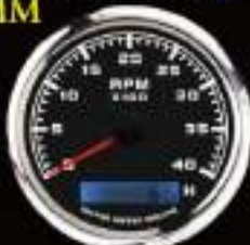
MMTA270-40HB ELECTRICAL TACHOMETER 0-4000 RPM WITH HOUR METER