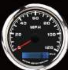
MMSP270-120B-MP ELECTRICAL SPEEDOMETER 0-120 MPH WITH ODOMETER