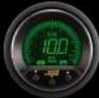
488OP (BAR/PSI) ELECTRICAL OIL PRESSURE GAUGE W/ ELEC. SENSOR