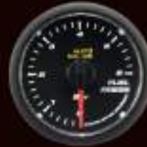
348FP-52C (Bar / PSI) ELECTRICAL FUEL PRESSURE GAUGE W / SENSOR