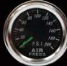
375MAPB-200 MECHANICAL DUAL AIR SUSPENSION GAUGE BLACK FACE & CHROME RIM PSI : 0-200PSI