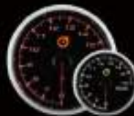
550OBD2-VO 60mm ANALOG VOLT GAUGE