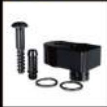
F60BO-1 FOR BENZ M270