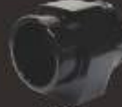
F4052 52 m/m FOR WATER TEMP GAUGE SENSOR USE