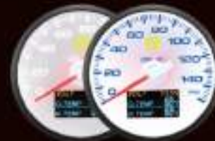
333OP4W (BAR. °C / PSI. °C) ANALOG : ELECTRICAL OIL PRESSURE DIGITAL : VOLT / OIL TEMP / WATER TEMP W / SENSOR