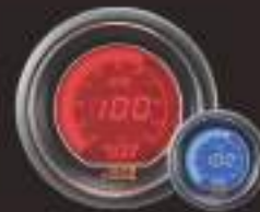
512WT(°C / °F) ELECTRICAL WATER TEMP GAUGE W / SENSOR