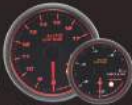
458VA-52 (Bar / inHg) 458VA-60 (Bar / inHg) ELECTRICAL VACUUM GAUGE W / SENSOR WARNING : VACUUM > 0 BAR