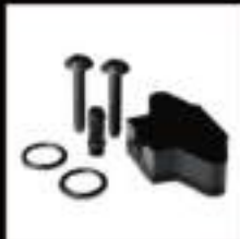
F60BO-5 FOR BMW N20