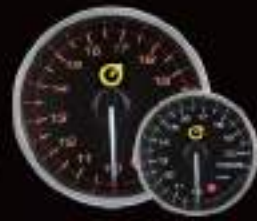
355WB-52 355WB-60 ELECTRICAL WIDEBAND AIR/FUEL RATIO GAUGE W/ BOSCH LSU 4.9 O2 SENSOR 0.5V OUTPUT