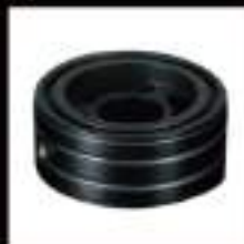
F60OP-3 FOR HONDA R18/R20A