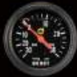
286BO MECHANICAL BOOST GAUGE 0 - 100PSI