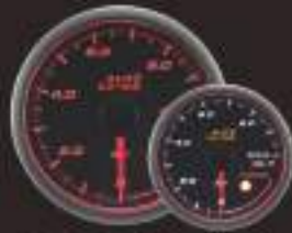
458OP-52 (Bar / PSI) 458OP-60 (Bar / PSI) ELECTRICAL OIL PRESSURE GAUGE W / SENSOR WARNING : OIL PRESSURE < 0.75 BAR