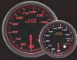
458OT-52 (°C / °F) 458OT-60 (°C / °F) ELECTRICAL OIL TEMP GAUGE W / SENSOR WARNING : OIL TEMP > 118 °C