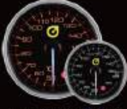
355OT-52-WP (°C/°F) 355OT-60-WP (°C/°F) ELECTRICAL OIL TEMP GAUGE W / SENSOR