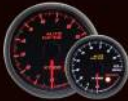
430RPM-52 430RPM-60 ELECTRICAL TACHOMETER GAUGE 0-10,000 RPM WARNING : RPM > 6,500 RPM