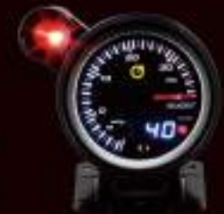
599WB OUTSIDE SHIFT LIGHT NEED TO PURCHASE SEPARATELY