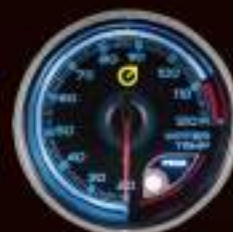
812WT-RC (°C/°F) ELECTRICAL WATER TEMP GAUGE W / SENSOR