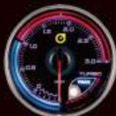
812BO-RC (BAR/PSI) ELECTRICAL BOOST GAUGE W / SENSOR