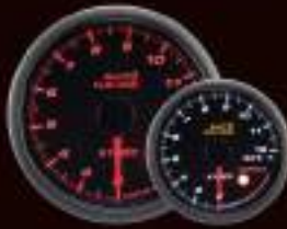
430EGT-52 (°C / °F) 430EGT-60 (°C / °F) ELECTRICAL EXHAUST GAS TEMP GAUGE WARNING : EGT > 350 °C W / SENSOR