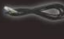
208SMOWTWH SENSOR WIRE FOR STEPPER MOTOR OIL TEMP & WATER TEMP GAUGE