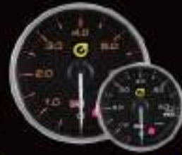
355FP-52-WP (BAR/PSI) 355FP-60-WP (BAR/PSI) ELECTRICAL FUEL PRESSURE GAUGE W / SENSOR