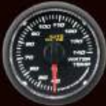
348WT-52C (°C / °F) ELECTRICAL WATER TEMP GAUGE W / SENSOR