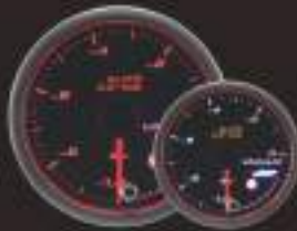
548VA-52 (Bar / inHg) 548VA-60 (Bar / inHg) ELECTRICAL VACUUM GAUGE W / SENSOR