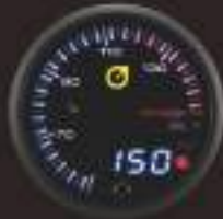
586OT (°C/°F) ELECTRICAL OIL TEMP GAUGE W / SENSOR