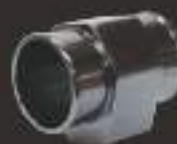
F4042 42 m/m FOR WATER TEMP GAUGE SENSOR USE