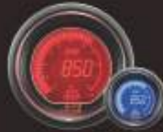
512EGT(°C / °F) ELECTRICAL EXHAUST GAS TEMP GAUGE W / SENSOR