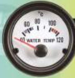
250WTW-12 (FOR 12V) WATER TEMP GAUGE (W/SENSOR) 40°C-120°C