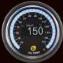
308OT-52C (°C/°F) ELECTRICAL OIL TEMP GAUGE W / SENSOR