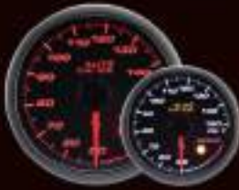
430OT-52 (°C / °F) 430OT-60 (°C / °F) ELECTRICAL OIL TEMP GAUGE W / SENSOR WARNING : OIL TEMP > 110 °C