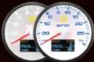
333BO4W (BAR. °C / PSI. °C) ANALOG : ELECTRICAL BOOST DIGITAL : VOLT / OIL PRESSURE / OIL TEMP W / SENSOR