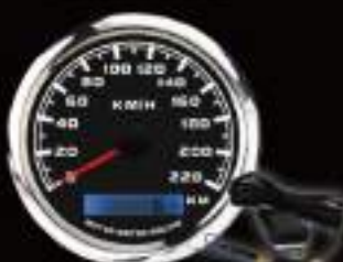
MMSP270-GPS-220B MMSP270-GPS-300B ELECTRICAL GPS SPEEDOMETER 0-220 KM/H 0-300 KM/H WITH ODOMETER W/GPS SENSOR