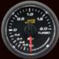
348BO-52C (Bar / PSI) ELECTRICAL BOOST GAUGE W / SENSOR