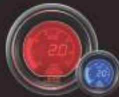
512FP(Bar/PSI) ELECTRICAL FUEL PRESSURE GAUGE W / SENSOR