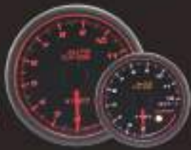
458EGT-52 (°C / °F) 458EGT-60 (°C / °F) ELECTRICAL EXHAUST GAS TEMP GAUGE WARNING : EGT > 850 °C W / SENSOR