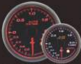
458BO-52 (Bar / PSI) 458BO-60 (Bar / PSI) ELECTRICAL BOOST GAUGE W / SENSOR WARNING : BOOST > 1.5 BAR