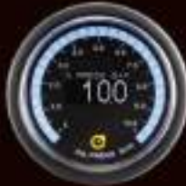
308OP-52C (BAR/PSI) ELECTRICAL OIL PRESSURE GAUGE W / SENSOR