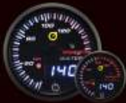
599WT (°C/°F) ELECTRICAL WATER TEMP GAUGE W/ SENSOR