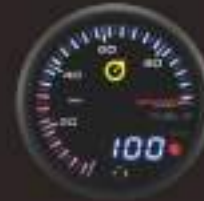
586FP (BAR/PSI) ELECTRICAL FUEL PRESSURE GAUGE W / SENSOR