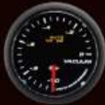
348VA-52 (Bar / inHg) ELECTRICAL VACUUM GAUGE W / SENSOR