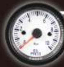
275OPW-12V 52mm ELECTRICAL OIL PRESSURE GAUGE (W/SENSOR) 0 BAR ~ 10 BAR