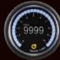
308RPM-52C ELECTRICAL TACHOMETER GAUGE 0 - 9,999 RPM