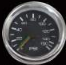
375MAPB-150(Psi) 375MAPB-10(BAR) MECHANICAL DUAL AIR SUSPENSION GAUGE BLACK FACE & CHROME RIM PSI : 0-150PSI BAR : 0-10BAR