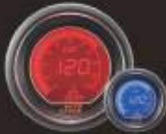
512OT(°C / °F) ELECTRICAL OIL TEMP GAUGE W / SENSOR