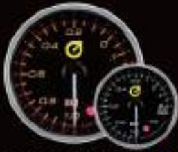
355VA-52-WP (BAR/PSI) 355VA-60-WP (BAR/PSI) ELECTRICAL VACUUM GAUGE W / SENSOR