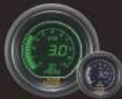
612OP(Bar/PSI) ELECTRICAL OIL PRESSURE GAUGE W / SENSOR