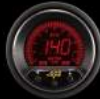
488WT (°C/°F) ELECTRICAL WATER TEMP GAUGE W/ SENSOR