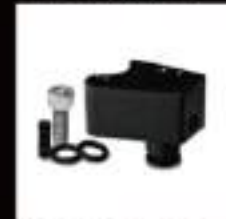
F60BO-12 FOR FOCUS MK3.5