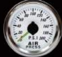
375MAPW-200 MECHANICAL DUAL AIR SUSPENSION GAUGE WHITE FACE & CHROME RIM PSI : 0-200PSI