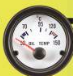
2500TW-12 (FOR 12V) OIL TEMP GAUGE (W/SENSOR) 50°C-150°C