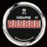
MMWKHM-DCR DIGITAL HOUR METER GAUGE