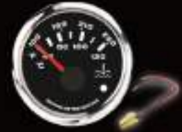
MMWTW-90B(40120) ELECTRICAL WATER TEMP GAUGE WARNING-95°C W/SENSOR 40-120°C/100-250°F