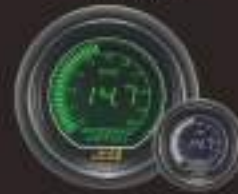
612WB ELECTRICAL WIDEBAND AIR / FUEL RATIO GAUGE W / BOSCH LSU4.3 O2 SENSOR 0 - 5V OUTPUT