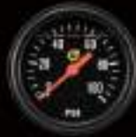
286MP-100PSI MECHANICAL PRESSURE GAUGE 0 - 100PSI