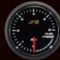
348FP-52 (Bar / PSI) ELECTRICAL FUEL PRESSURE GAUGE W / SENSOR