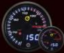
599OT (°C/°F) ELECTRICAL OIL TEMP GAUGE W/ SENSOR