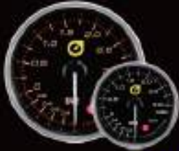
355BO-52-WP (BAR/PSI) 355BO-60-WP (BAR/PSI) ELECTRICAL BOOST GAUGE W / SENSOR