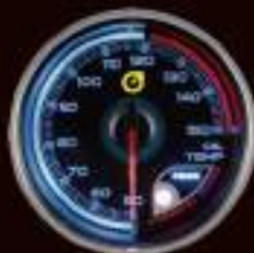
812OT-RC (°C/°F) ELECTRICAL OIL TEMP GAUGE W / SENSOR