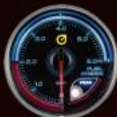
812FP-RC (BAR/PSI) ELECTRICAL FUEL PRESSURE GAUGE W / SENSOR