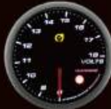
360VO-SM2 ELECTRICAL VOLT GAUGE