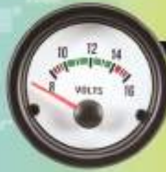
250VOW-12 (FOR 12V) 52mm ELECTRICAL VOLT GAUGE 8V-16V